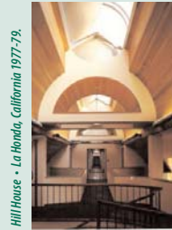
Hill House - La Honda, California 1977-79.