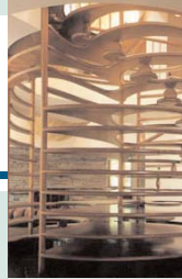
Hill House - La Honda, California 1977-79.