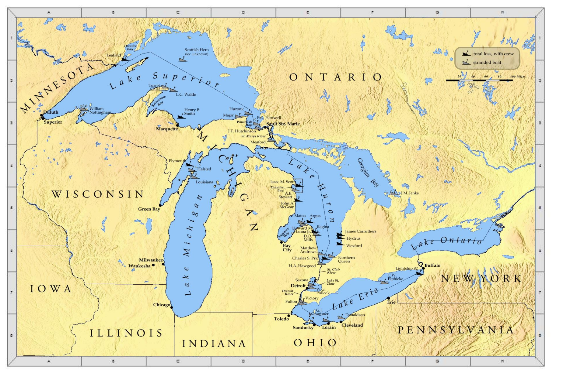
The Great Lakes: Water-Resilient Cities ?