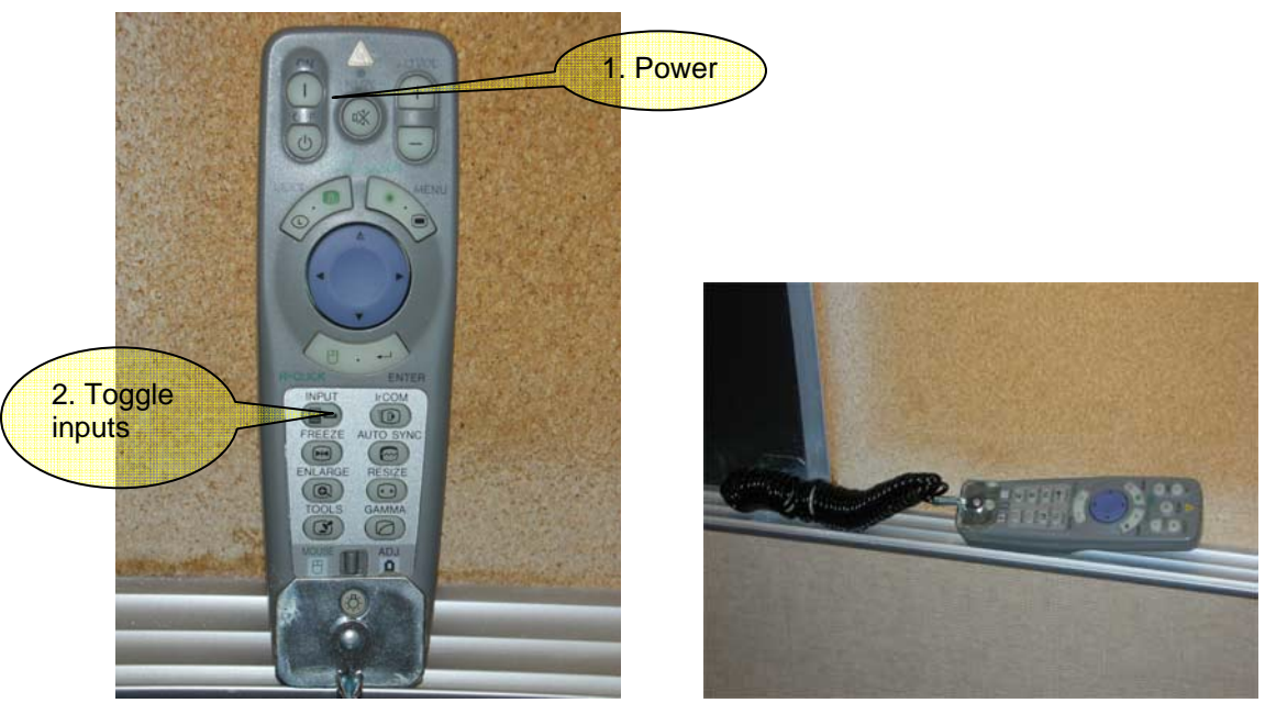
To turn off the projector, select the off button, twice, on the remote.